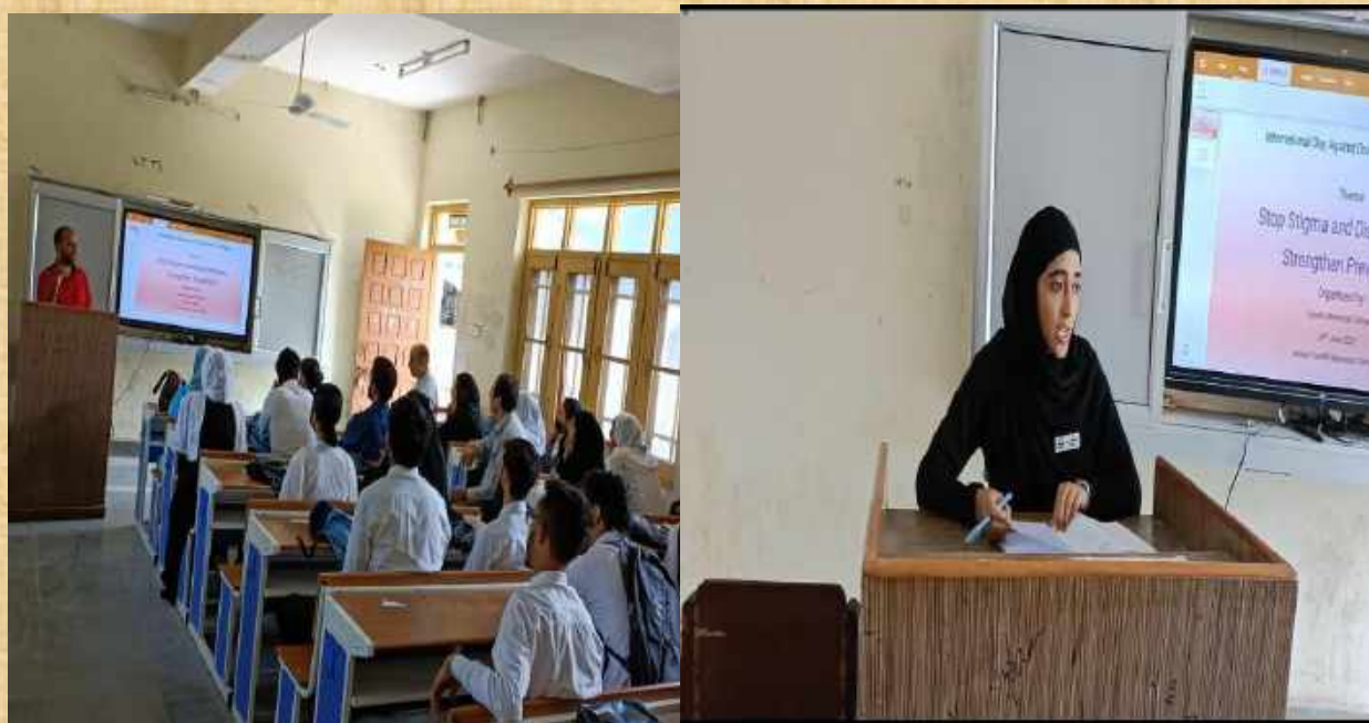
One day seminar on the eve of 'International Day against Drug Abuse and Illicit Trafficking' was organized on 26/06/2023