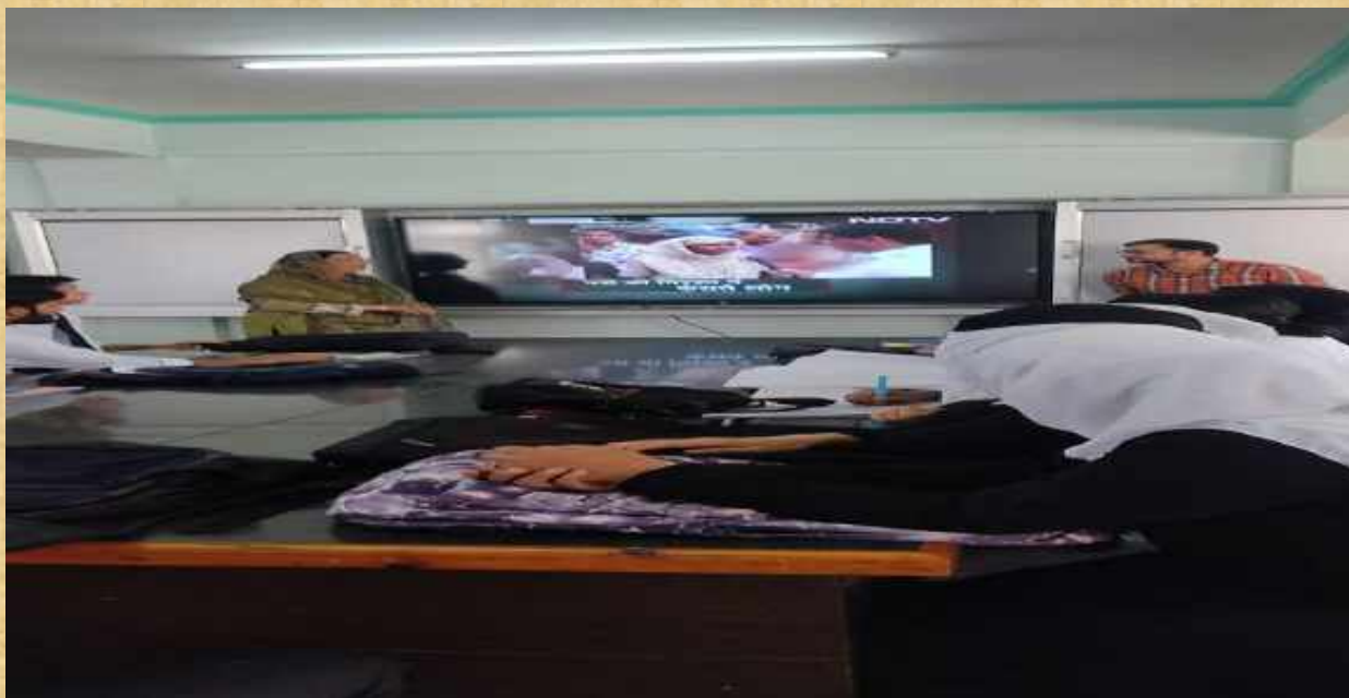
A Documentary screening on Drug Abuse was held in collaboration with the Department of Zoology on 23/06/2023

The NSS Wing organized a number of awareness programmes in collaboration with different Departments on the theme of Drug Abuse. The primary objective of these awareness programmes was to educate student community regarding the risks, consequences, and prevention measures associated with drug abuse. These awareness programmes were designed to comprehensively tackle different facets of drug abuse and encourage the adoption of healthier behaviors among students.